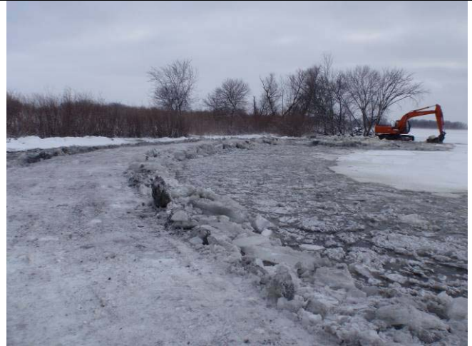
Looking south toward the north end of the berm.