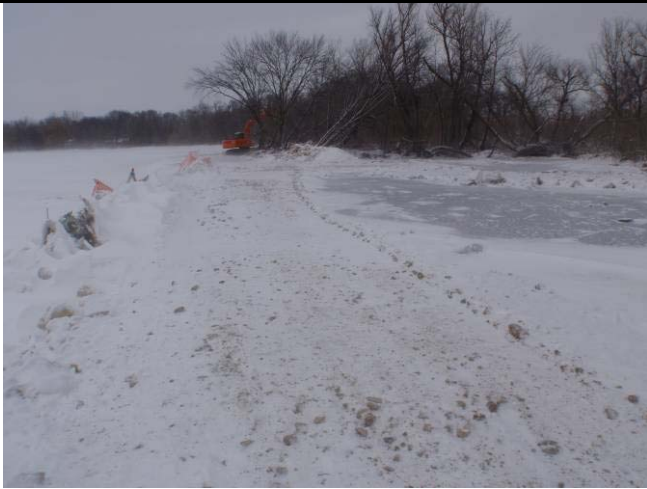
At the center the berm looking north.