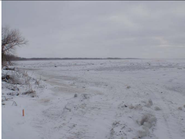
At the boat launch, looking SE onto the eastern side of the dredge area.

Description of Observation: The silt curtain has been placed but is covered by snow and frozen in place. The traffic control measures have been placed around the dredge area. Ice roads to access the dredge site have been built, and some dredge material is stockpiled. The ice roads are also acting as perimeter control as silt socks are no longer practical. There is continuity between the ice road and the silt curtain for a full perimeter. Dredging is on hold until ice road repairs are complete. A small amount of dredge material has been stock piled.