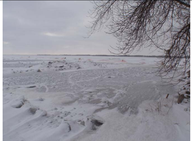
At the boat launch, looking SW onto the western side of the dredge area.