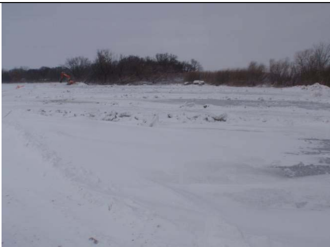
At the south end of the berm looking north onto the dredge placement area.

Description of Observation: The silt curtain has been placed but is covered by snow and frozen in place. The traffic control measures have been placed around the dredge placement area. The berm is constructed over geotextile, and the geotextile is also separating the riprap from the breaker run. The berm is about 95% complete with some basic tie in work remaining. There are small stockpiles of stone that will be used to complete the berm construction.