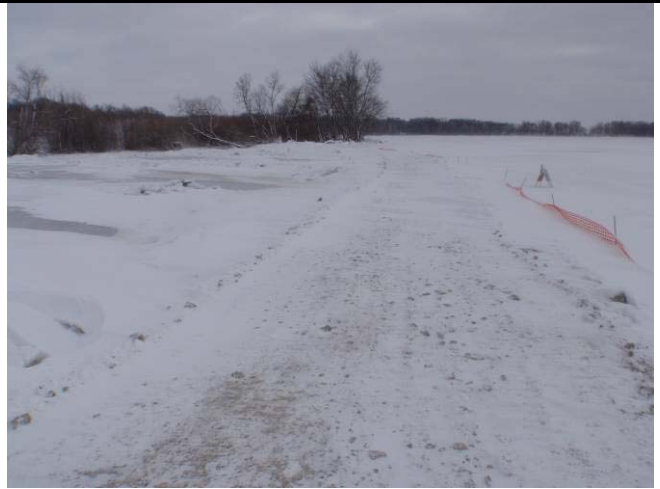
At center of the berm looking south.