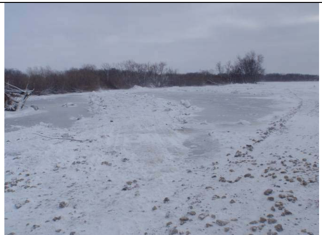
At the north end of the berm looking south onto the dredge placement area.