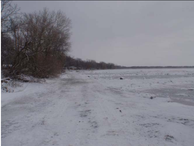
At the boat launch, looking SW.

Description of Observation: The crew has completed the ice road and were actively using it for construction. Currently, repairs are being performed as the water level has risen, and ice heaves and cracks have formed.