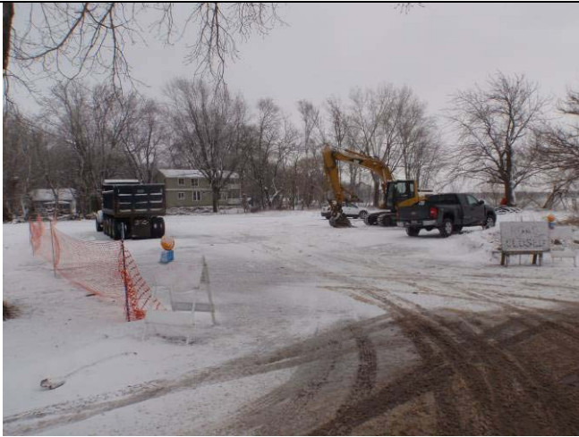
At the entrance of the staging area, looking east.

Description of Observation: The construction fencing has been placed and a Road Closed sign is at the entrance. All vehicles and equipment are utilizing the staging area and it appears to be in good condition.