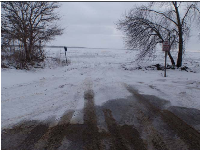
At the tracking pad, looking south.

Description of Observation: The tracking pad has been placed and appears to be functioning appropriately.